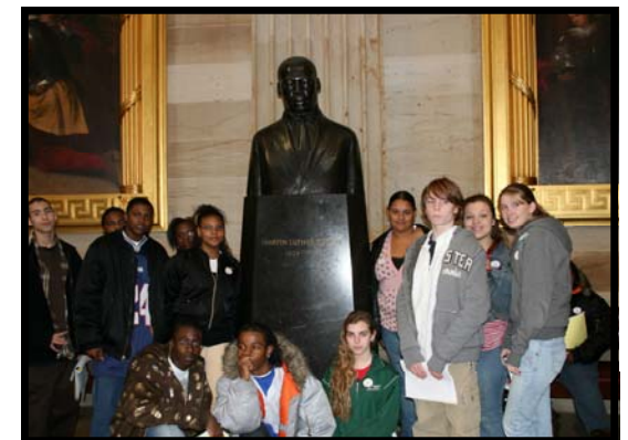
School Trip to Washington D.C.