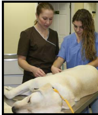
Student Shadowing with Vet

The new 3 R's of education are Rigor, Relevance, and Relationships, and SEC is majoring in all three! Our students are involved in service learning, field trips, project-based learning, and job shadowing co-ops. Each student is