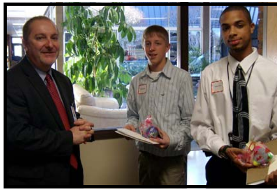
Students Job Shadowing at the Board of Education